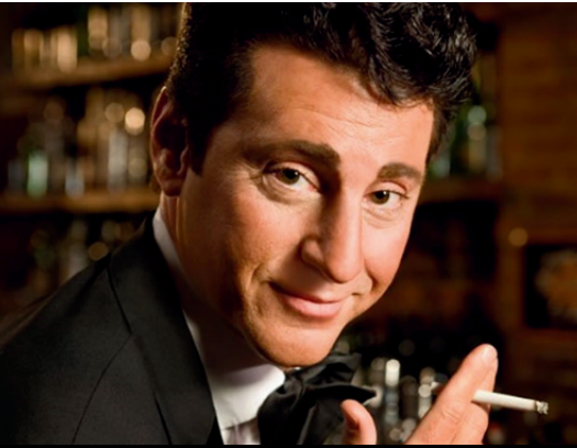
That's Amore!: A Tribute to Dean Martin