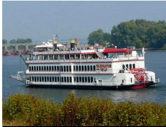
Celebration Belle Mississippi River Cruise