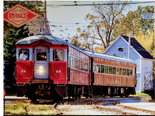
Fall Colors Luncheon Train