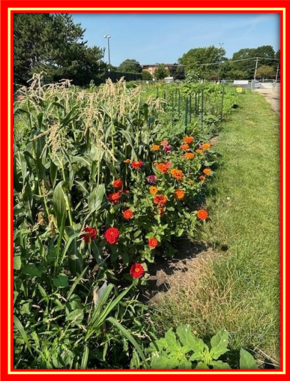
Outlined in zinnias!