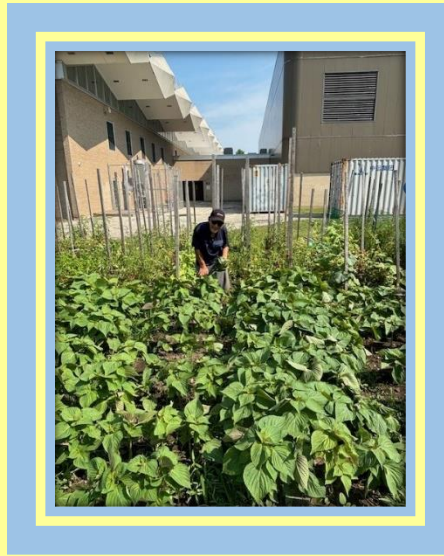
Choong harvesting peppers